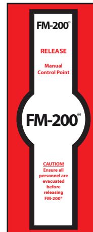
Figure 32 - Manual Release Sign (Part No. 314.205.003)

A notice should be located at each manual release position.