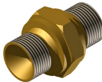
Figure 25 - Male Pilot Hose Connector (Part No. 309.013.007)

The male pilot hose connector is used to connect two pilot hoses together for systems where a second container of a different size is used to protect a different enclosure. For example: a large container is protecting a room and a separate smaller container protects the subfloor, and both containers are to actuate simultaneously, and a hose longer than Part No. 306.205.003 is required.