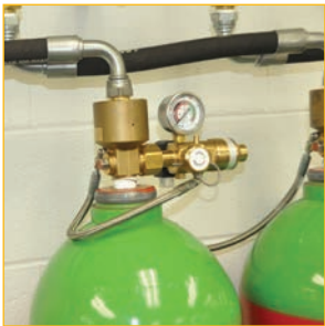
Quick-Connect Actuation Hoses

Compared with other high pressure inert gas systems, our series 400 valve regulates flow and pressure to allow the use of Schedule 40 piping for many applications. Installation time and labor costs are further reduced with the use of pre-fabricated manifolds, quick-connect actuation hoses and electrical connectors.